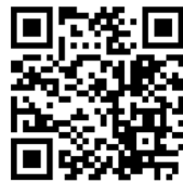
WELLINGTON FREE AMBULANCE