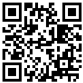
TE AROHA HOME CARE