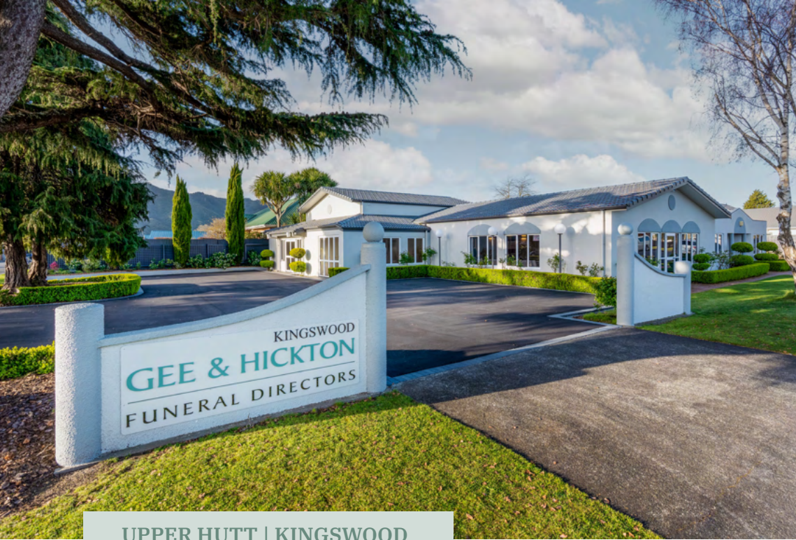
UPPER HUTT | KINGSWOOD

Kingswood funeral home is a modern chapel and provides comfortable reception facilities as well as convenient off-street parking. The homely reception lounge is available for friends and family to get together before and after the funeral. Should you wish, we can arrange refreshments in our lounge or at a venue of your preference.